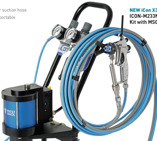
NEW iCon X3 ICON-M233N Multi Spray Kit with MSGS-200