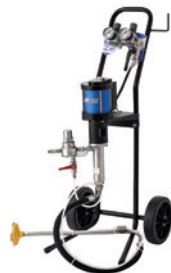
iCon X-3 30:1

A must-have for any production style shop spraying one or more gallons of material per week. From general woodworking to exterior surface coating, our Multi Spray Units are ideally suited to meet any size shop needs. These pumps are easy to maintain, reliable and versatile. Available in multiple pressure ratio configurations to meet your unique requirements.