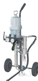
MSU 32N 17:1